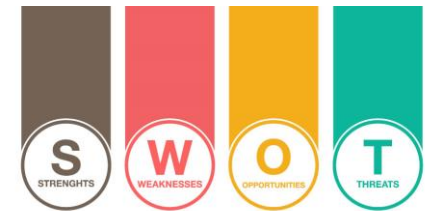
New Cairo, Cairo