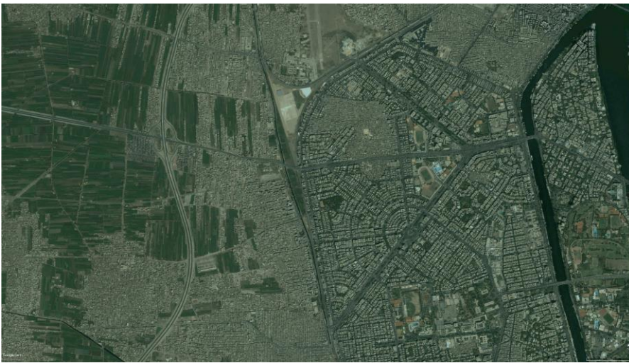
Mohandesen Vs. Bolaque 2004